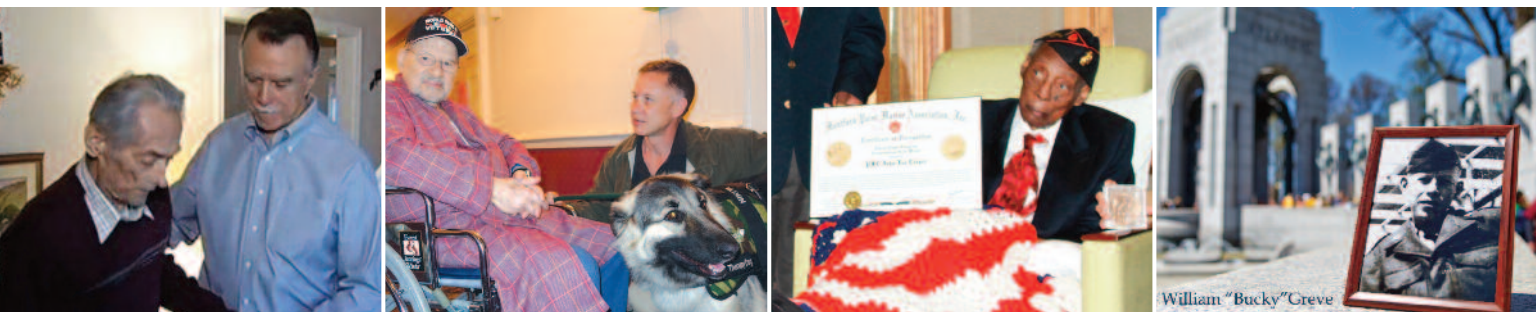
(FROM LEFT:)