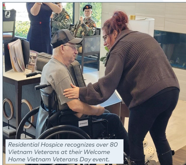
Residential Hospice recognizes over 80 Vietnam Veterans at their Welcome Home Vietnam Veterans Day event.