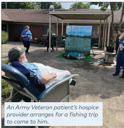
An Army Veteran patient's hospice provider arranges for a fishing trip to come to him.